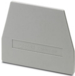
End cover, length: 61 mm, width: 2.2 mm, height: 48.5 mm, color: gray

Please be informed that the data shown in this PDF Document is generated from our Online Catalog. Please find the complete data in the user's documentation. Our General Terms of Use for Downloads are valid ( http://phoenixcontact.com/download )